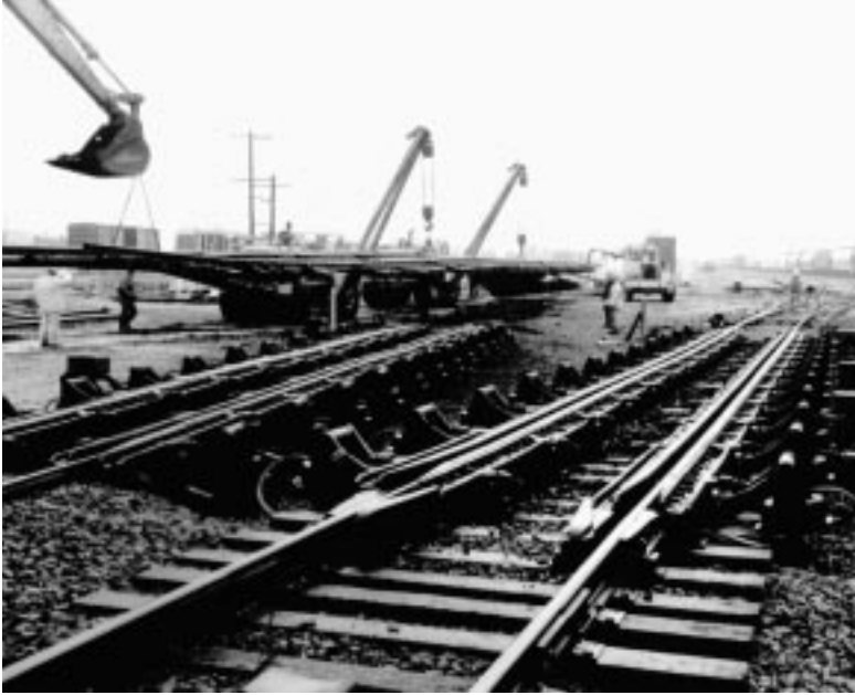
Belt forces replace two lap switches.