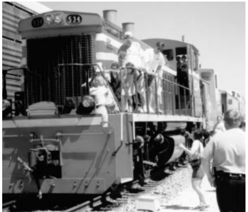
Families pose for pictures aboard the Belt's Bicentennial/Operation Lifesaver locomotive at Franklin Park's Railroad Daze.

In addition to the rail equipment display, the fair featured children's games, mini train rides, stagecoach and trolley rides, food, a spike driving contest, and railroad memorabilia. The fair has turned into quite an event for the village and places the railroad industry in a positive light.