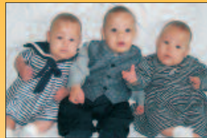
The triplets at seven months. Just look at them now!