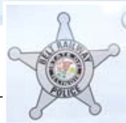
The decals on the squad car promote a dual message.