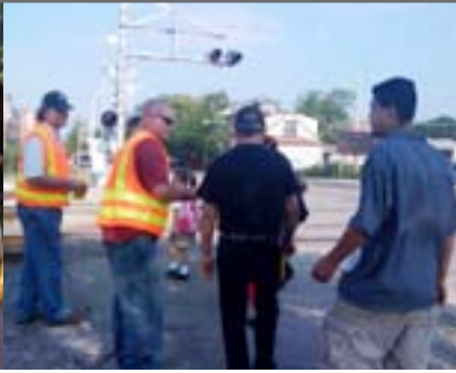
Members of the BRC Safety Committee and BRC Police Department distribute fliers to alert students about the dangers of crossing the tracks.