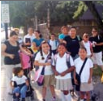
Students and their parents were receptive to the message.