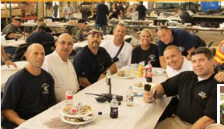
Members of the Bedford Park Fire and Police departments attend the Employee Safety Awareness Barbecue.

Thanks to all volunteers who made the event a huge success.