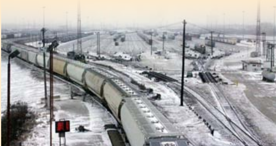
As winter approaches, BRC employees will be subject to cold, snowy and icy conditions. Preparation is the best way to stay warm and avoid slips, trips and falls.

“It’s better to over prepare for the conditions we may face.”