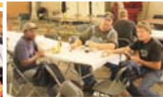
Employees from all shifts enjoy great food.